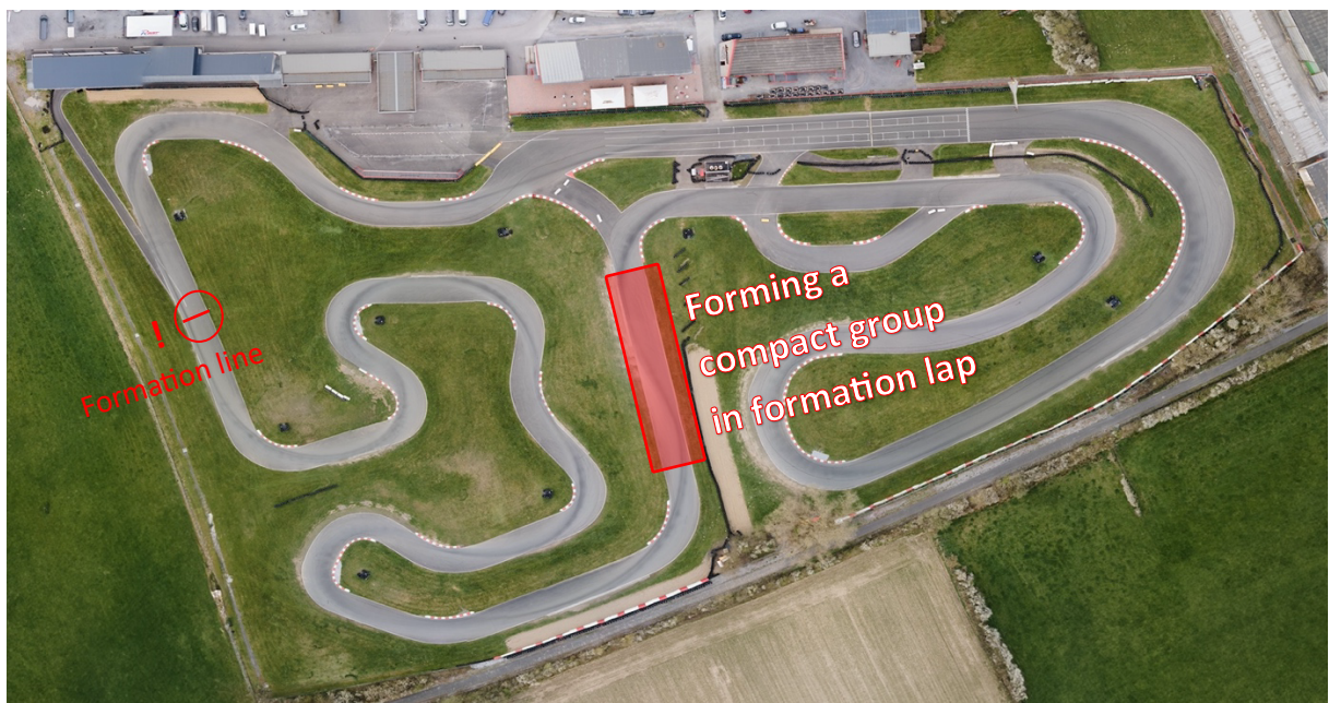
Figure 2. Top view Mariembourg. Formation details.